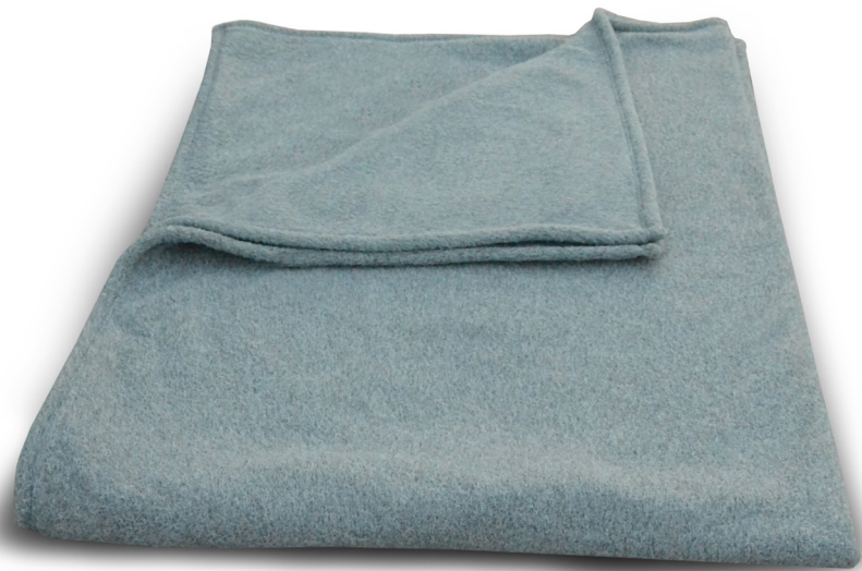
High Thermal Synthetic Blanket - UNHCR/UNICEF Standard