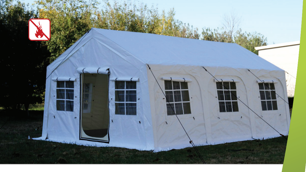
Huggy™ 24 Tent